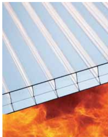
Makrolon® multi UV FR