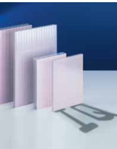
Makrolon® multi UV IQ-Relax