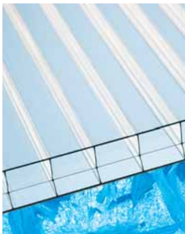
Makrolon® multi UV HR